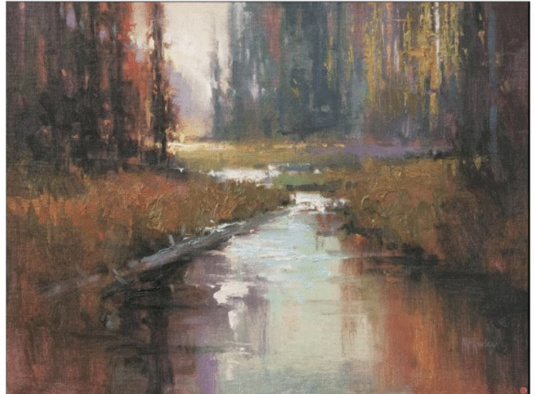
Richard McKinely, Cascades Aglow , oil, - 12 x 16 po.

https://streamlinepublishing.com/inside-art/making-a-painting-vs-a-picture/