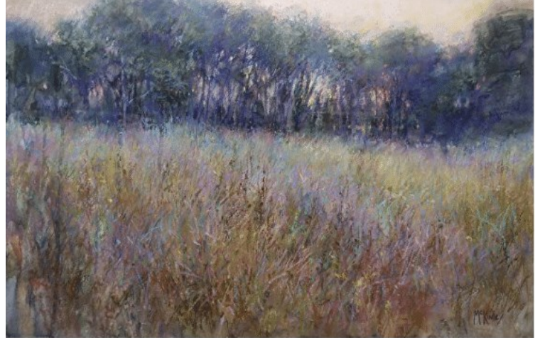
Richard McKinely, Field Dance , pastel, 11 x 14 in

7. Play! It is just a piece of paper or canvas . Take a chance, make a mess, experiment. More will be gained from a failed attempt than a predictable outcome.