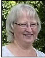
Ann De Benedetti Web Site