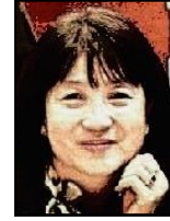
Ling Kang Hospitality